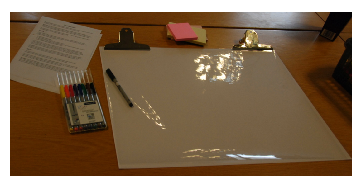
FIG. 1. A blank workspace for multilayered paper prototyping

In order to investigate user preconceptions of information within a domain, and to provide interface surrogates for the purpose of investigating possible conceptual models, we first investigated the use of a variant on card sorting (initially using cards and then using sticky notes to simplify transportation of the resulting designs). However, several practical issues quickly became apparent. Firstly, multi-level models (for example, FRBR's Manifestations, contained within Expressions and encapsulated within a Scholarly Work) could not easily be represented in this manner. Secondly, investigation of relationships between items or elements was not easy to visualize and to revise. Thirdly, the cards themselves, and the surfaces on which they were grouped, rapidly gained a very large number of annotations. Initial experience with this method also showed that participants modeling complex data structures were forced to 'overload' cards with multiple meanings - for example, a given card could represent a term/metadata element, a relation between terms, or an entity. This suggested that the resources provided were insufficient to enable fluent expression of the different characteristics of a given model.