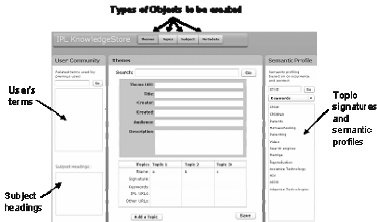
FIG. 5. A sample screen of the integrated interface.