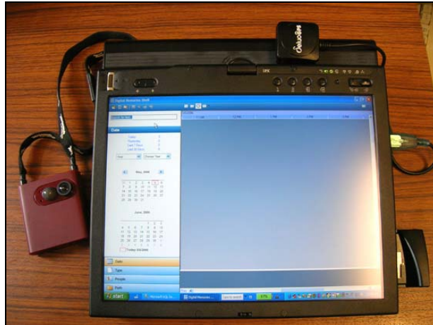
Figure 1: M 2 SenseCam (left) and MLB Calendar Display

It is important to note that we are exploring the use of technology and metadata to support students' memory and reflection. We are leaving aside, for now, the key issue of privacy, which introduces many complex legal and social issues—and require separate in-depth research.