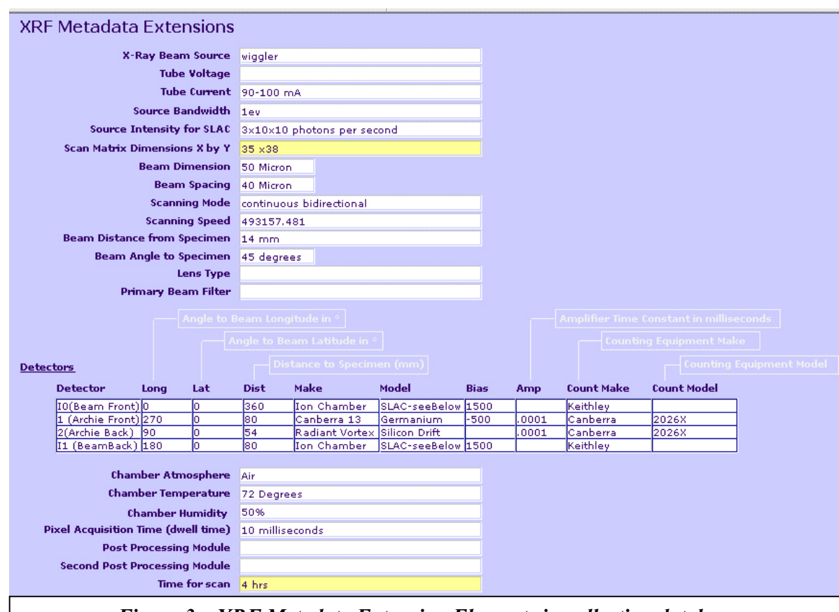
Figure 3 – XRF Metadata Extension Elements in collection database

The XRF imaging of the Archimedes Palimpsest required a unique set of metadata extensions to capture the new data elements for different imaging techniques, energy levels and data formats. With no scanning XRF imaging standards available in the XRF literature, the team created a draft set of metadata extensions. These were incorporated into a collection database prior to the first XRF imaging session. The XRF imaging team then refined the additional metadata elements in a dynamic process, while entering data during 24-hour imaging sessions lasting up to 12 days. The numerous variables in position around the manuscript, high energy levels and elemental information had not been anticipated during the early optical imaging phases of the program, requiring significant additional metadata in the XRF Extensions (as excerpted from the collection database in Figure 3). The XRF team reviewed the metadata elements and updated the current draft of the Archimedes Palimpsest Metadata Standard XRF Extensions at the end of the imaging session [12]. This standard is also available for broader review on the archimedespalimpsest.org website.