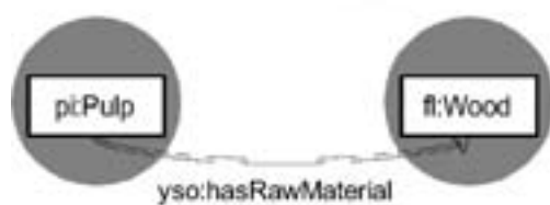
Figure 2: Simple interdependent ontologies

Proxies are a crucial mechanism for separating individual ontologies for distributed development. A proxy is a local representation of a remote entity – in our case an ontology concept. When an ontology is exported for development from the development repository, references with other ontologies within the development repository are replaced by proxies.