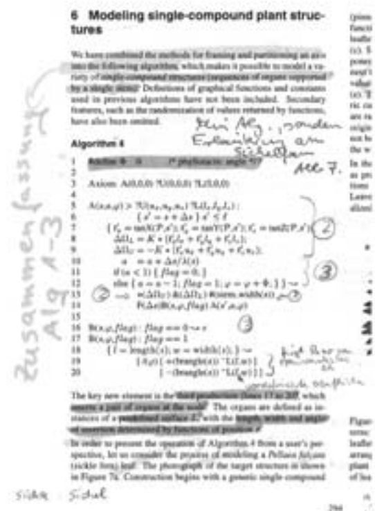
Figure 2: Annotation of paper documents.

How somebody annotates the document depends on the reading goal and on the personal likes and dislikes. The interesting aspect is that different annotation types have different meanings to the reader. Hence, it is worthwhile to analyze the annotations and to classify annotations based on their types. This allows the typespecific visualization of annotations. Furthermore, it is often necessary to store information about the annotation such as the name of the author and the date of creation. Especially if the chronological order of annotations is important. Both can be achieved using SVG which combines the possibilities of storing annotation data using simple geometric models and the description of the annotation