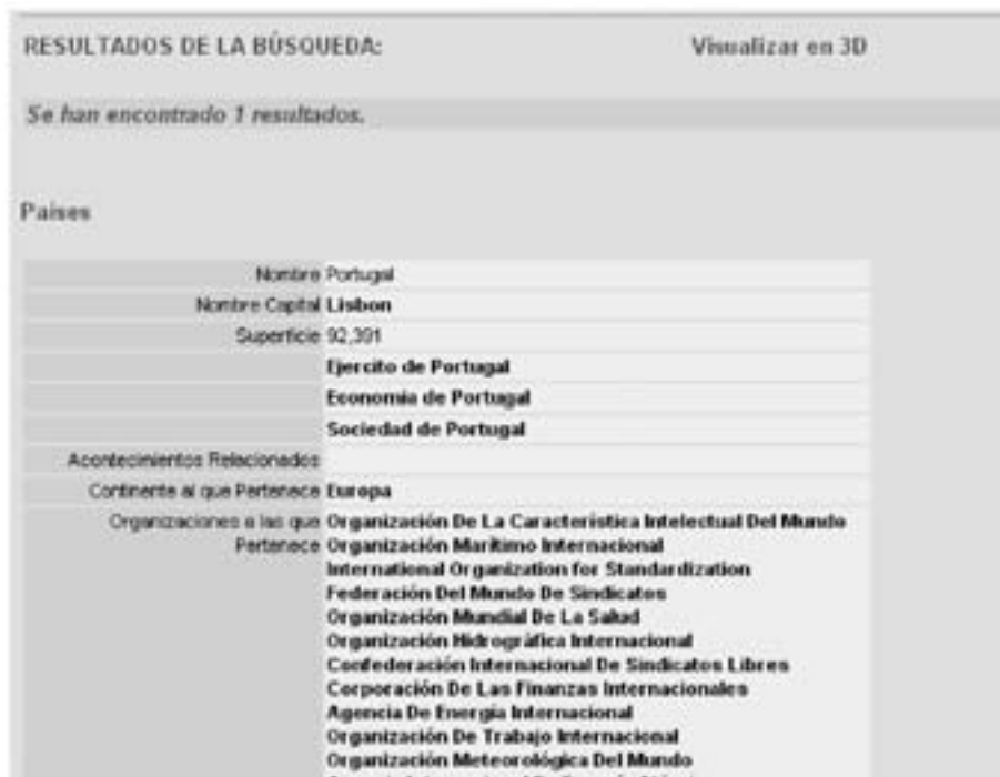
Figure 1: Semantic Portal for International Affairs: Text based visual output for limited screen size

for the ontology of International Affairs. The CIA fact book is a large online repository with actual information on most countries of the world, along with relevant information in the fields of geography, politics, society, economics, etc.