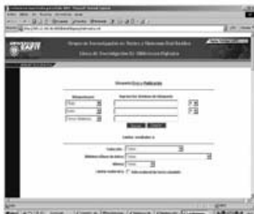
Figure 3: BDEAFIT Implementation.

Integration of digital libraries can be achieved by two approaches: integration using harvesting protocols like OAI-PMH and integration using online access such as Web Services, a variant of OAI-PMH [7] or a Z39.50 gateway. BDMetaLib has implemented OAI-PMH, a variant of OAI-PMH and web services. In order to allow an easy integration of digital/referential libraries, we have adopted simple DCMI with the addition of one element ( bde:library ).