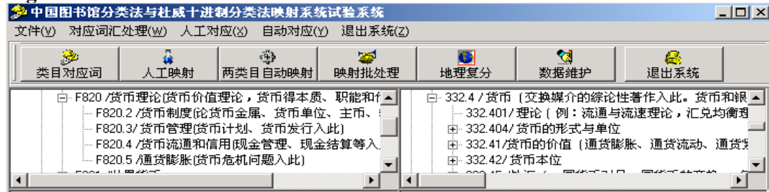
Figure4-1. The basic interface of automatic mapping system