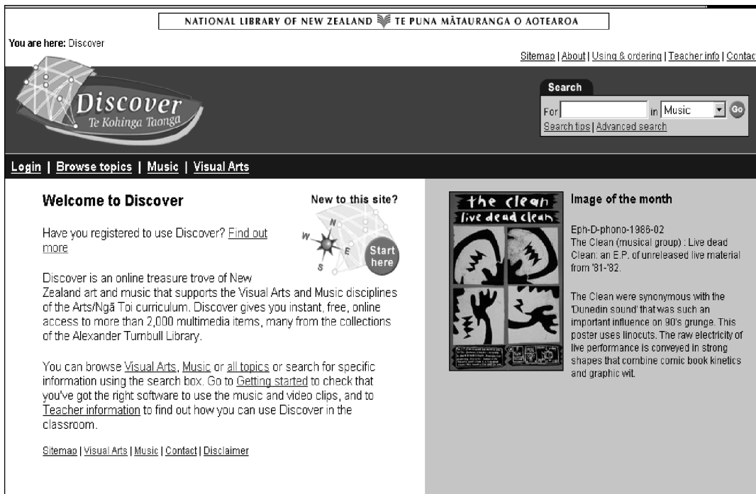
Figure 2. Discover homepage