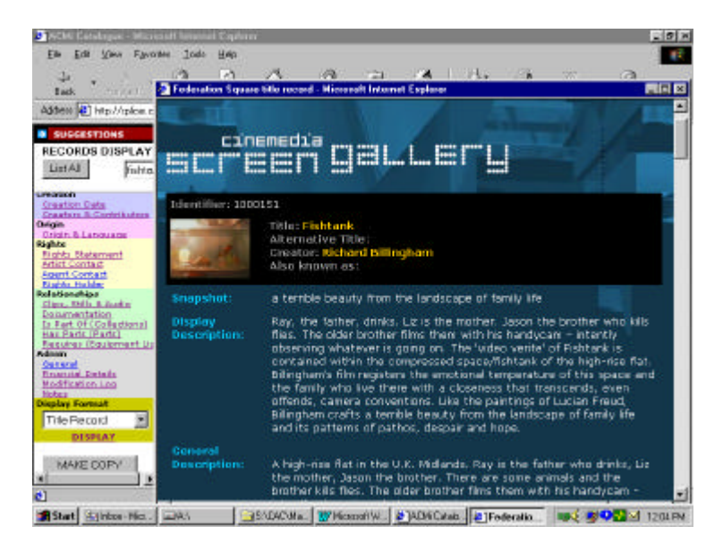
Fig 4. Screen grab showing output of non-administrative elements as a single HTML display

Outputs currently in development include: