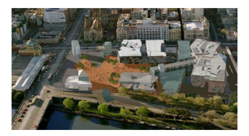
Fig 1. Aerial impression looking north with Flinders St Station on the left

ACMI will include some interesting concepts: a vast underground Screen Gallery for internationally significant digital art - to be exhibited on 300-400 screens of all kinds and sizes; a ground floor dedicated to screen literacy, in all its forms and another floor of cinemas. In addition, there is a commitment to delivering a satisfactory reflection of these screen-based experiences on-line. It's not just a conceit that the built environment articulates the open, multifaceted and federated qualities of the networked world. There's currently nothing quite like it anywhere else and, as you can imagine, it's an exciting project to be involved with.