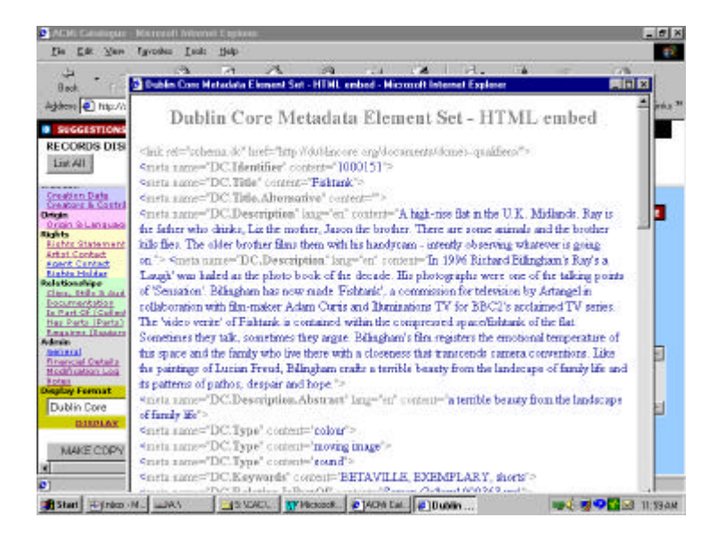
Fig 3. Screen grab showing output as a (qualified) Dublin Core HTML embedded version