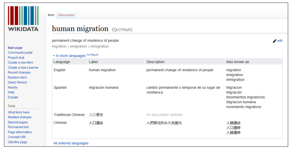
FIG. 3. Wikidata entry for "human migration" concept.

On top of that, murkiness in concept hierarchy also makes mappings less clear cut. Despite the fact that "Human migration" (Q177626) is a broader concept for "Immigration" (Q131288), "Emigration" (Q187668), and "Internal migration" (Q11880444) in Wikidata, "emigration" and "immigration" are, at the same time, also aliases, defined as "alternative name for an item or property," for their broader concept (see Figure 3) (Help:Aliases, n.d.). This makes one wonder how "Emigration and immigration" in LCSH should be mapped to Wikidata. The LCSH could be mapped to both "Emigration" and "Immigration" in Wikidata as they are the constituent concepts. Or, alternatively, the LCSH concept could be mapped to "Human migration" because of its aliases. The former approach will make the generation of knowledge cards problematic, while the latter approach maps across hierarchical levels.