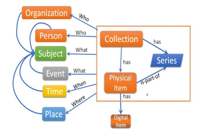
Figure 2. The initial Linked Archives model

and listed Person and Organization as its subclasses, but when testing the model with individuals, the Agent class appeared to be cumbersome and added an unnecessary layer that could complicate the data structure. It would serve only the role of grouping like classes together rather than holding individuals in the ontology. After weighing the benefits and drawbacks of several options in modeling Person and Organization, we decided to create separate classes for person and organization. The entities on the left side in Figure 2 were singled out because they were the key access points as well as the common content structure for archival representations.