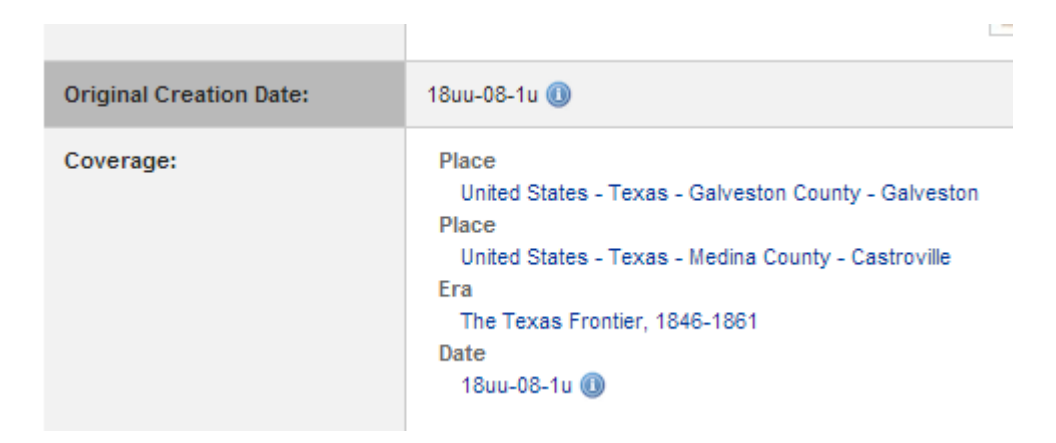
FIG. 3. Example of the icon displayed next to dates in the user interface.

Metadata creators unfamiliar with the EDTF and similar standards may also struggle initially with interpreting some of the guidelines. For example, the EDTF documentation does not explicitly state that "approximate" dates cannot also have a level of uncertainty (e.g., 189u~ for "circa 1890s"). However, the coded components in the EDTF that are used for validation can clarify some of the logical rules for applying various date types.